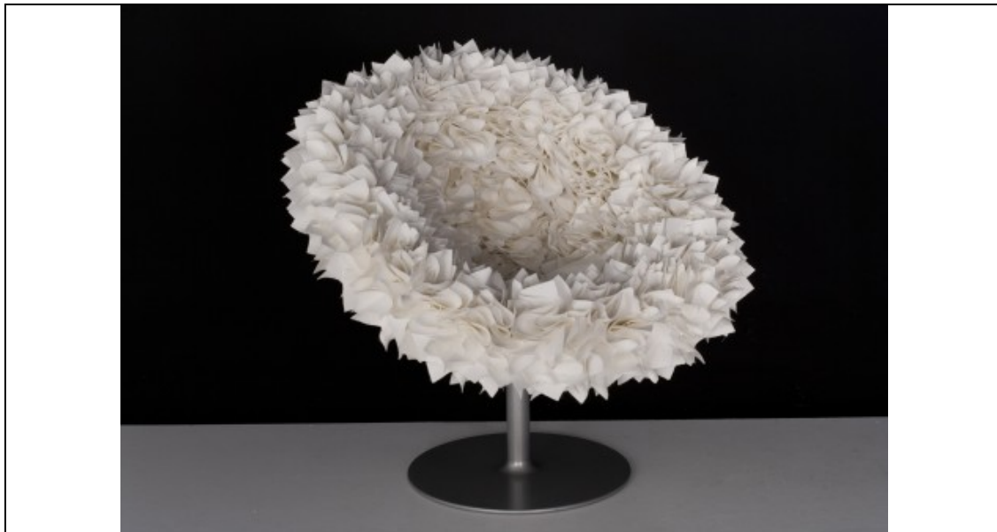
FIGURE B 'Bouquet chair' by Tokuji Yoshioka

The 'Bouquet' chair is made of hand-folded fabric squares sewn on one by one, to completely cover the internal surface of the egg-shaped shell.