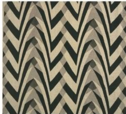
FIGURE B Product, designer and date unknown. Art Deco Textile Design