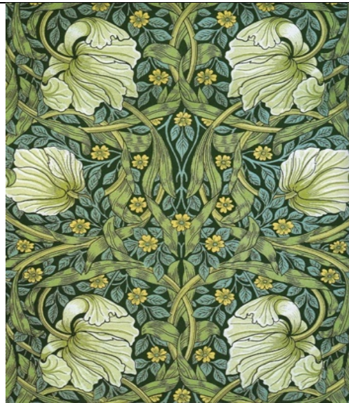
FIGURE A Pimpernel Wallpaper Design by William Morris (England) (1876) Arts and Crafts.

4.2 Compare FIGURE A and FIGURE B below and answer the questions that follow.