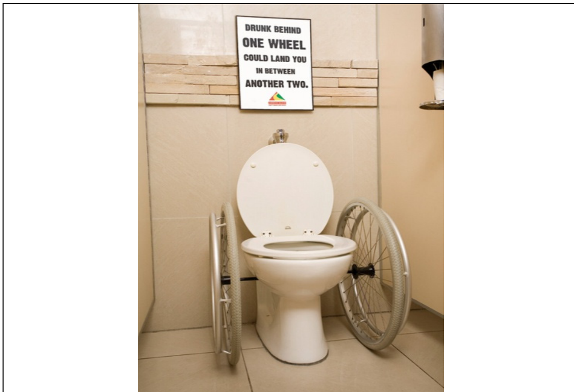
FIGURE B Wheelchair Poster by Jupiter Drawing Room for the 'Arrive Alive' campaign (2007) (South Africa)

5.2 Study the poster below and answer the question that follows.