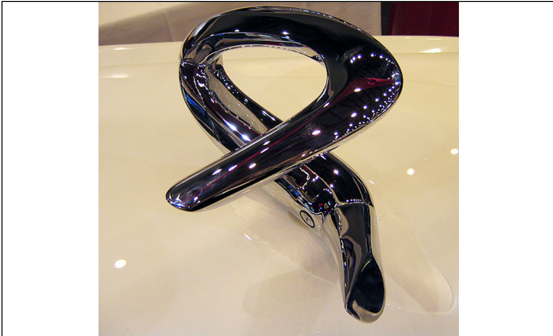
FIGURE A Tri-Flow tap by Zaha Hadid

A tap design by the award-winning architect, Zaha Hadid, for the British company, Triflow Concepts. The design looks like a freestanding, stainless steel sculpture and is able to dispense water in three different ways; both conventional hot and cold water streams are controlled by the handle and a separate waterway for filtered drinking water is activated by pressing an electronic button.