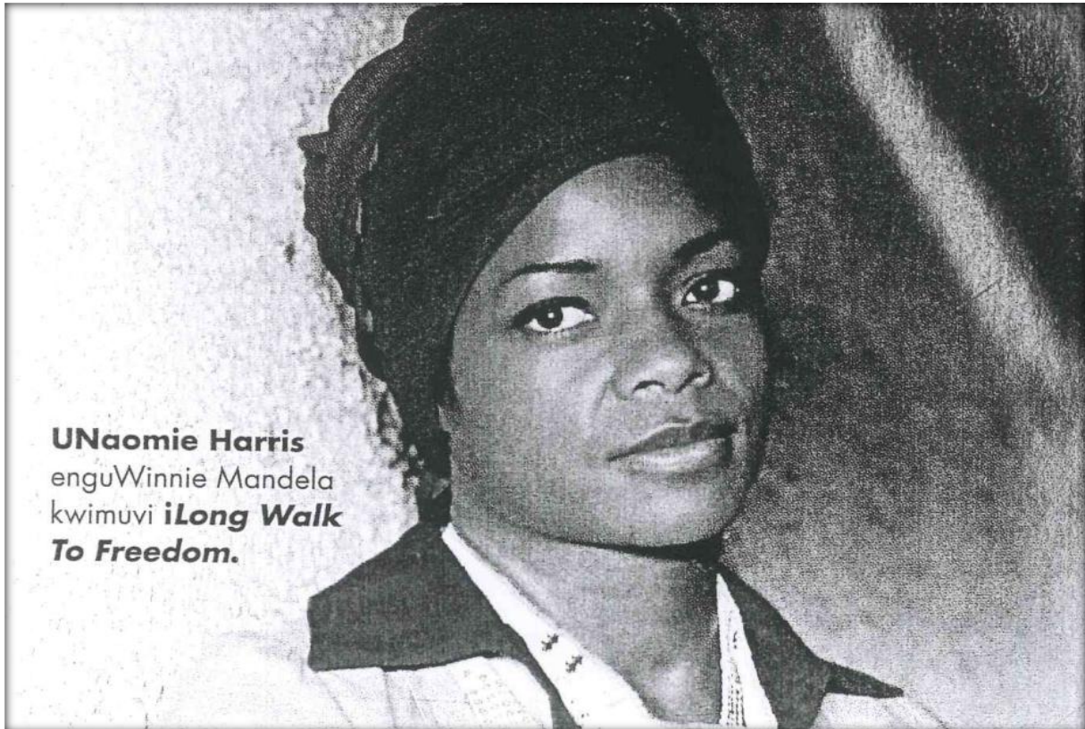
UNaomie Harris enguWinnie Mandela kwimuvi iLong Walk To Freedom.