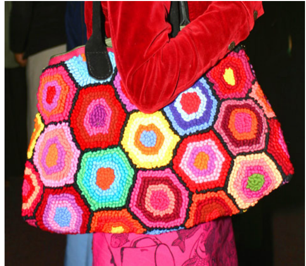
A bag by Mielie made out of cotton strips