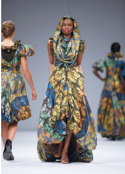
A South African textile design by Palesa Mokubung for Mantsho textiles. It is a fusion of western 1950s shapes and African colours and dress styles.

Create a design in your discipline, which reflects South Africa's multi-cultural society. Explore symbols, images, patterns, words, slogans, structures, etc., which reflect different cultures living in our country and integrate these to create a unified yet vibrant design. Use the images below as inspiration.