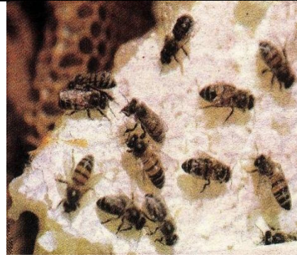
Bees are a deadly horror when they all swarm!

When beekeeper Reed Booth invited the team to film wild “killer beehive” extraction, the sound and cameraman had to wear fully sealed bee suits in 34 °C weather.