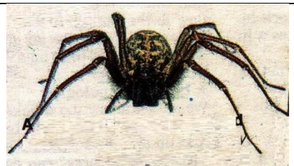
A phobia of spiders is called arachnophobia

But, although bees are dangerous the crew was fully protected but when the bees swarmed angrily, even wearing all that thick protection didn't stop the two crew members from getting scared because all it takes is one small opening for the bees to get inside!