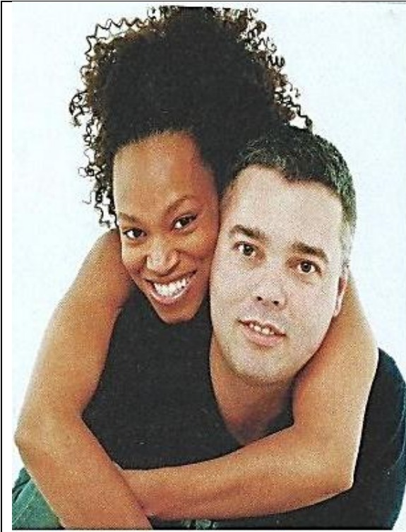
[Lo mfanekiso ucatshulwe kwimagazini iBona kaSeptemba 2011 iphepha 79]