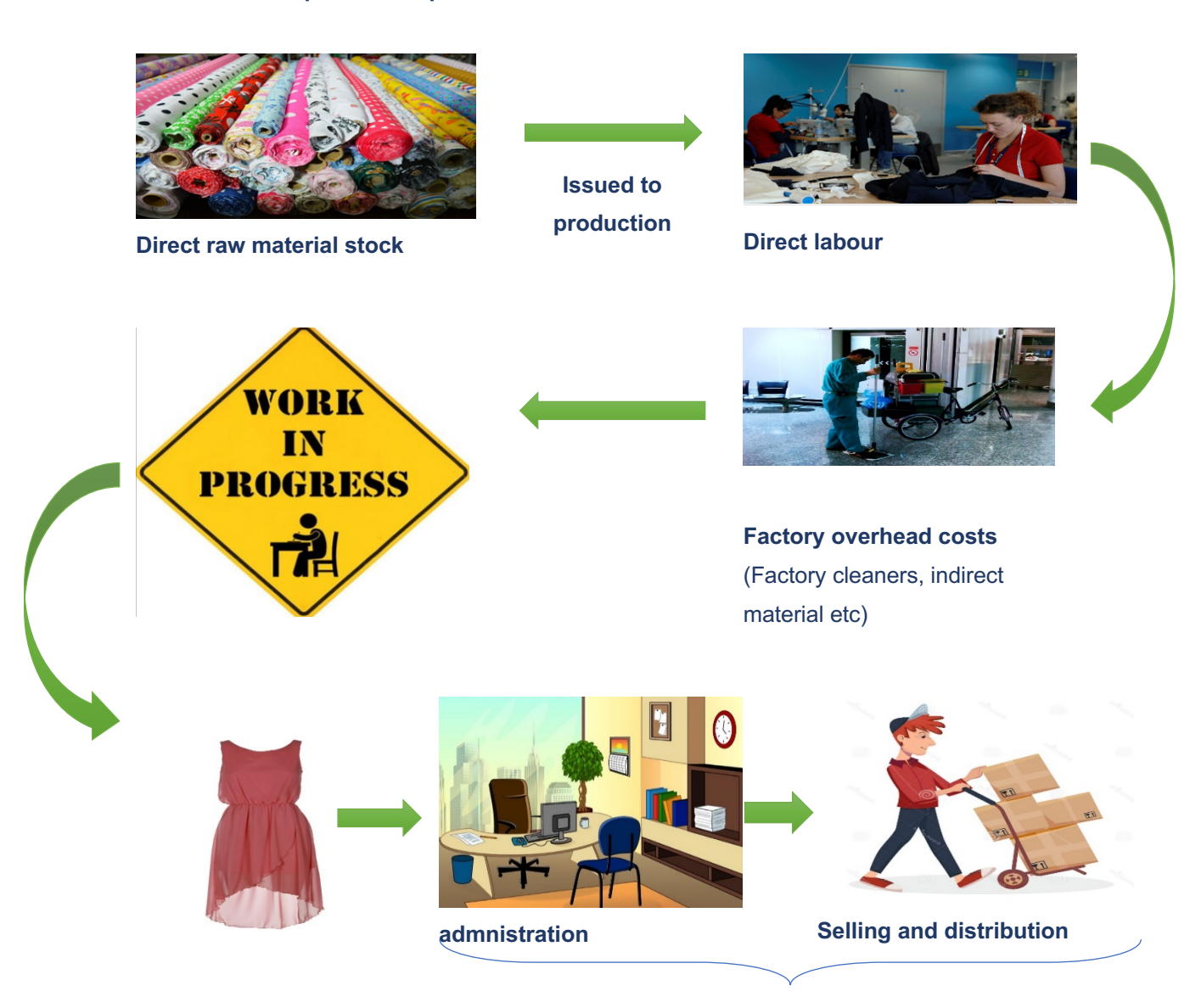
Illustration of a production process for a dress